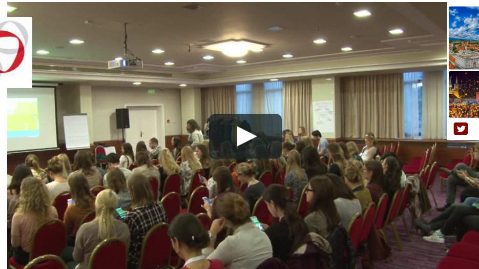
23rd ENOTHE Annual meeting, Zagreb, 2017. 330 participants