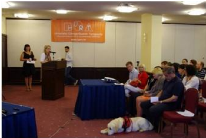
1st Croatian OT conference with international participation "Everyday rehabilitation in the community,, in Zagreb, 2013.

ENOTHE European Network of Occupational Therapy in Higher Education